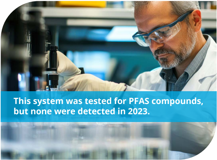
This system was tested for PFAS compounds, but none were detected in 2023.

Unregulated contaminants are elements that currently have no health standards assigned for drinking water. This table shows only the compounds detected in your system. No compounds were detected in your system. To learn about the full list of unregulated contaminants included in the monitoring program, please visit www.epa.gov/dwucmr .